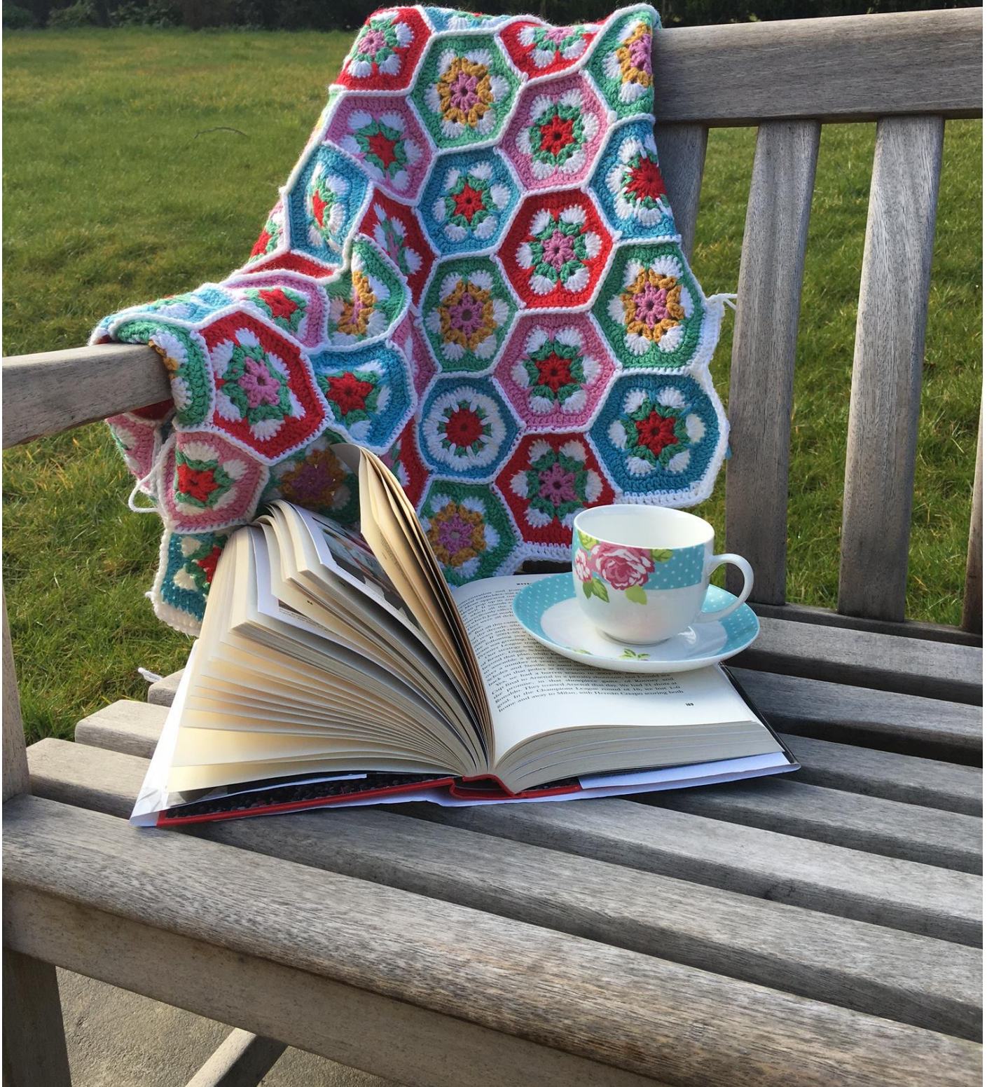
Cygnet Superwash DK 100% wool Spring Blooms Crochet Blanket